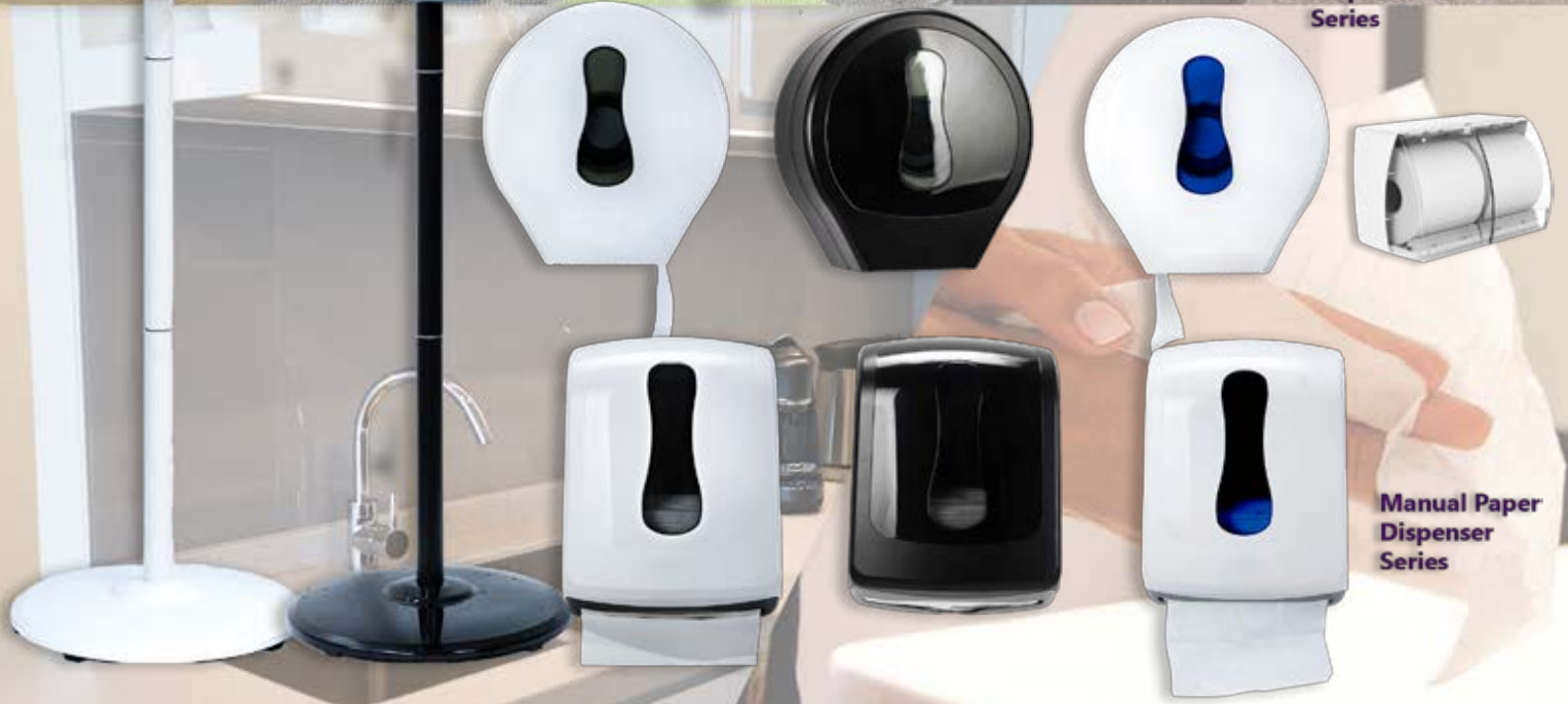
Manual Paper Dispenser Series