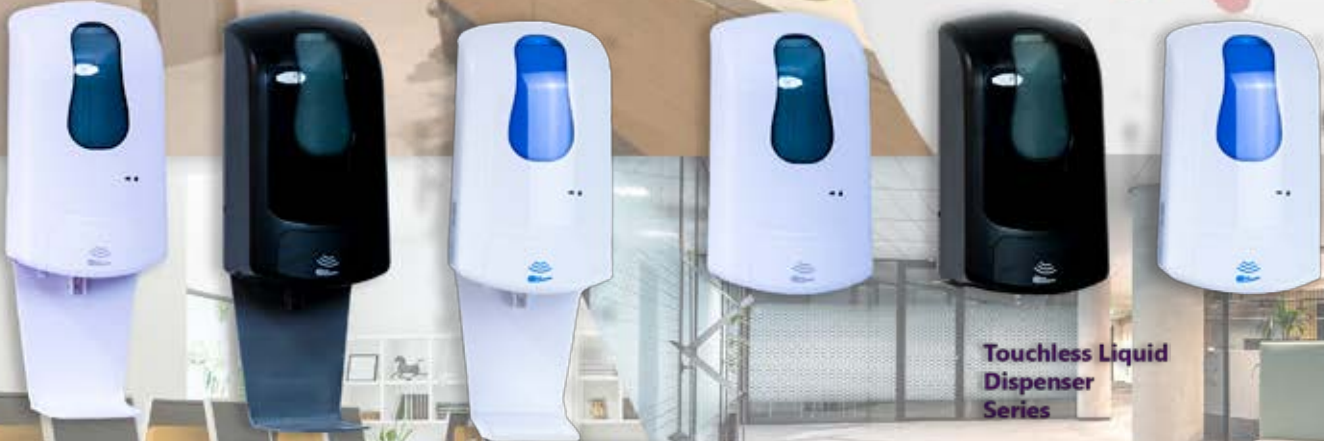
Touchless Liquid Dispenser Series