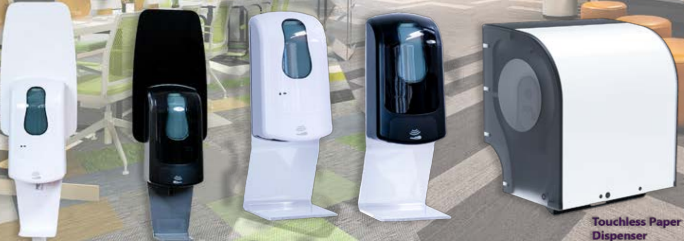
Touchless Paper Dispenser Series