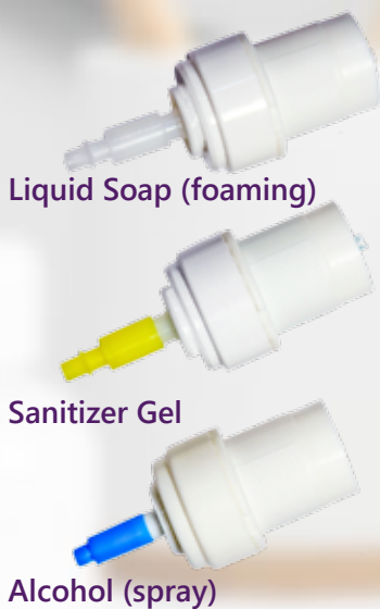
Liquid Soap (foaming)