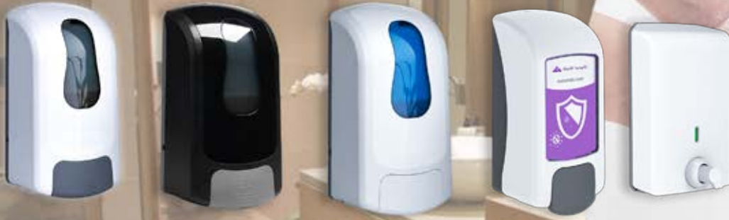
Manual Liquid Dispenser Series